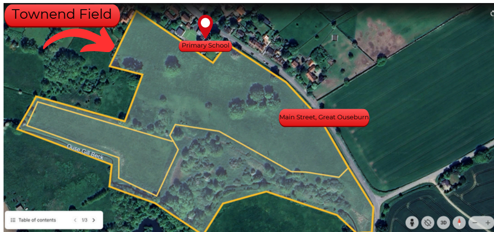
Field boundary, showing a suggested route of a permissive footpath within the land.

The land is located alongside the road and footpath between the two villages of Great and Little Ouseburn, offering the opportunity to integrate the reserve into the daily lives of local residents, pupils and visitors.