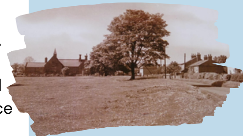
Townend Field looking towards Great Ouseburn c. 1950.