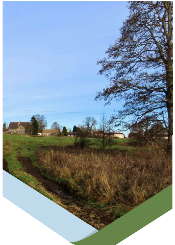
View towards the village primary school from the bottom field.

Funds must be raised by 28th February 2025.