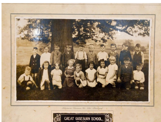
Children from Great Ouseburn Primary School sitting beneath the oak tree, Townend Field, in 1938.